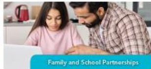
Family and School Partnerships